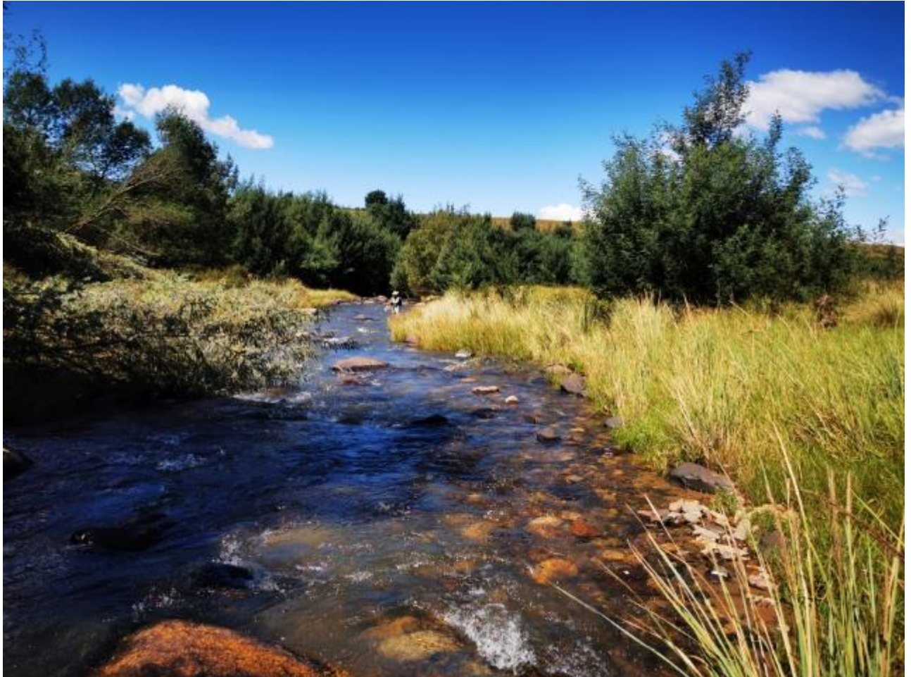
A Lotheni tributary

Sunday evening's cold front has touched the air with the brush of autumn: sublime weather that tastes like Trout, if you know what I mean.