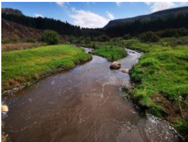
The Poort stream at Umgeni Poort