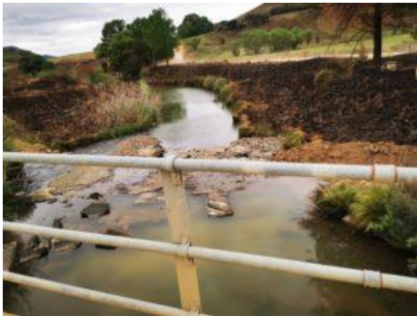
uMkhomazana River 14 Oct 2023

Underberg is dry, and it seems that the uMkhomazana, uMkhomazi and Lotheni are still clear and low, with no evidence of runoff.