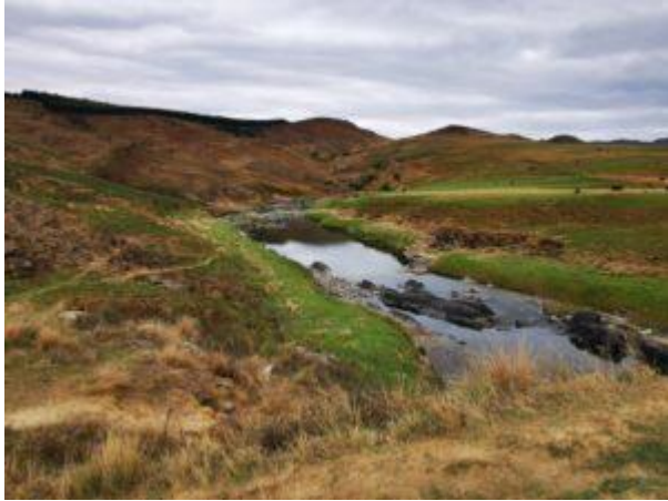
uMkhomazi River 14 Oct 2023