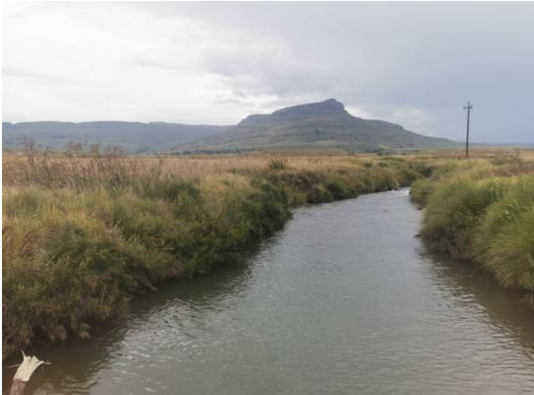
The Reekie Lyn from the road bridge

As I left the valley late yesterday, dark clouds were massed over the berg. Who knows what it will look like tomorrow!