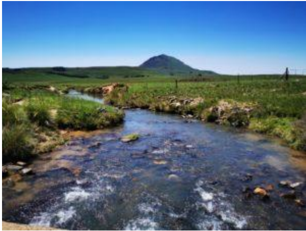
Reekie Lynn stream