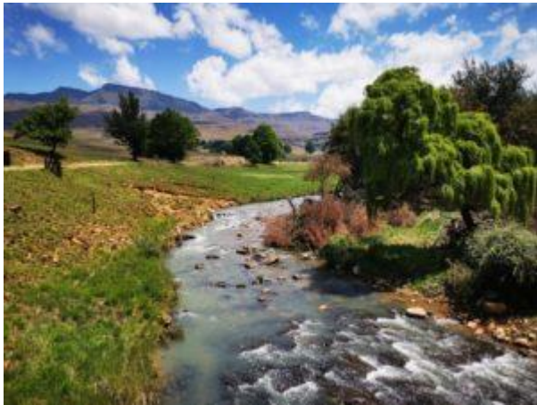
The Inzinga at Belmont