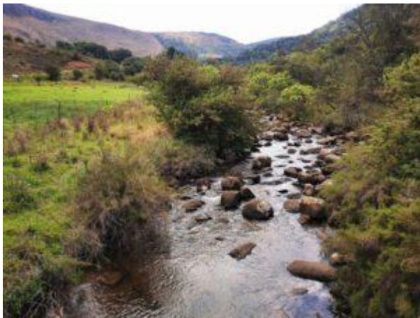
The uMngeni at New Forest