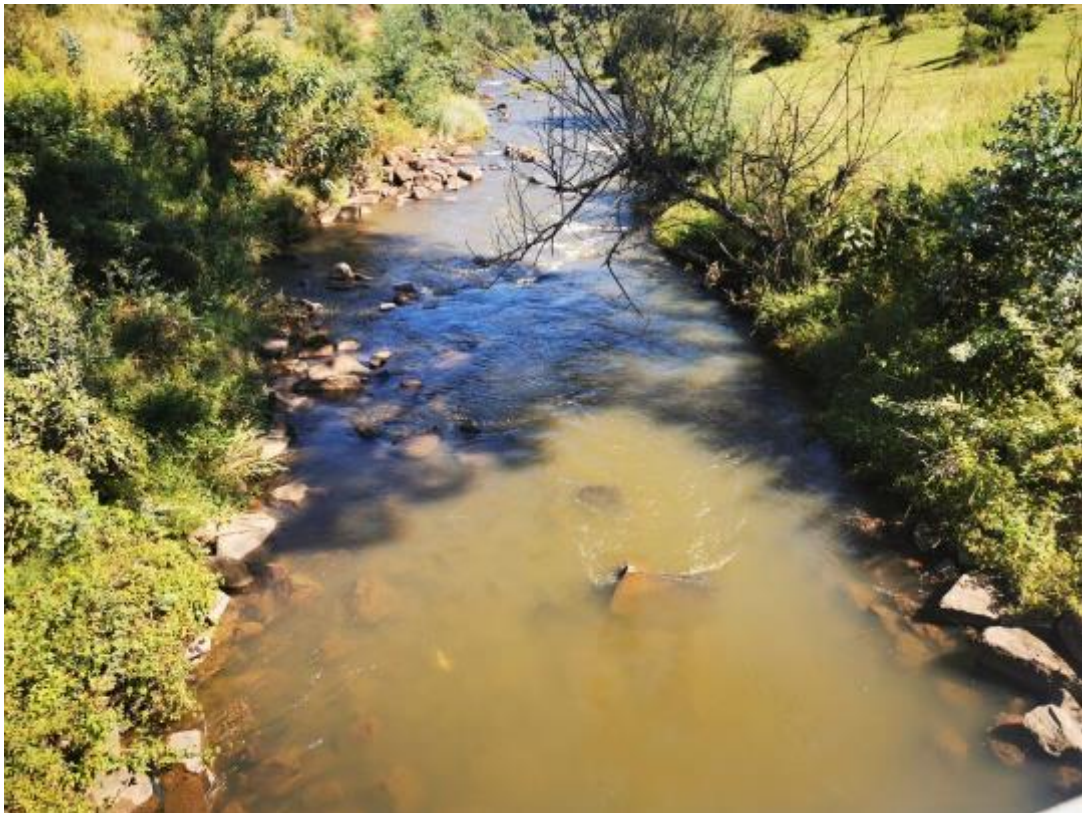
The uMngeni from the bridge below Chestnuts

On Thursday, I found the uMngeni tinged slightly with a mid brown muddiness, and coupled with that , strongly stained with its usual summer peat stain.