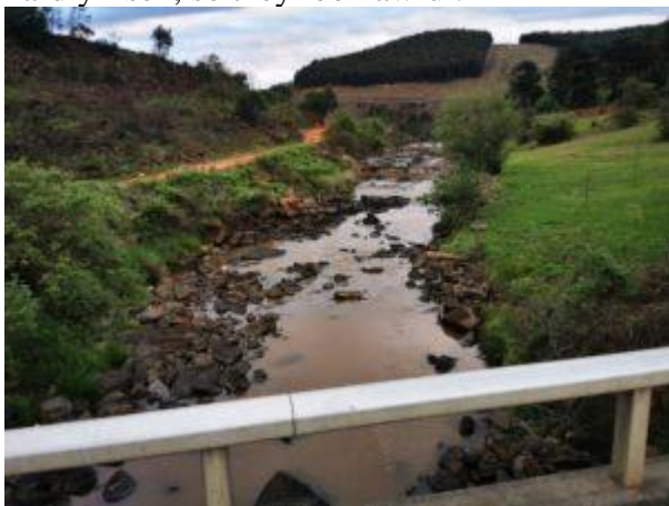
uMngeni at Chestnuts 14 Oct 2023

The Inzinga and uMngeni however , have had some runoff, and it shows because a slug of winter's road dust has entered the rivers (certainly down at the bridges on the Dargle/ Impendle/Stoffelton roads) and has turned them an awful opaque colour . But the levels have hardly risen, so they look awful: