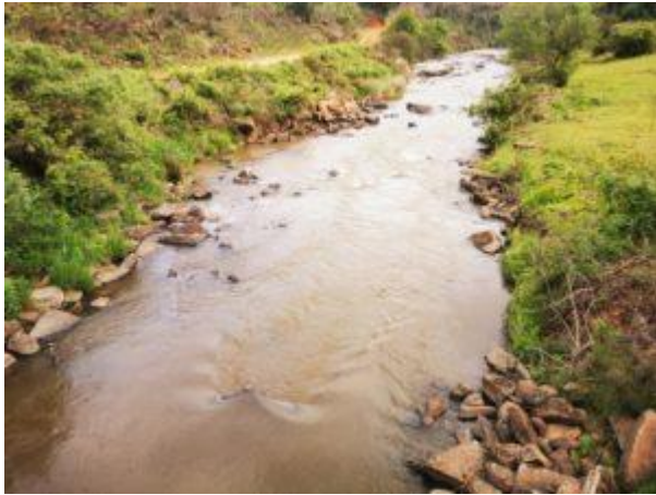
The uMngeni at Chestnuts