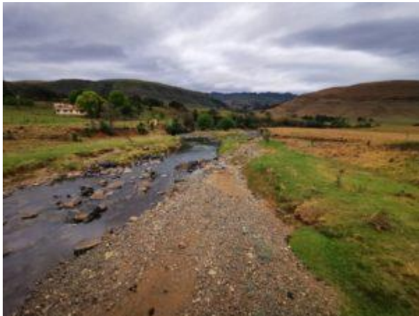
Lotheni River 14 October 2023

The Inzinga and uMngeni however , have had some runoff, and it shows because a slug of winter's road dust has entered the rivers (certainly down at the bridges on the Dargle/ Impendle/Stoffelton roads) and has turned them an awful opaque colour . But the levels have hardly risen, so they look awful: